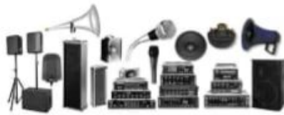
Public Address Systems