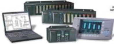
Building Automation Controller