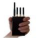
Cell Phone Jammer