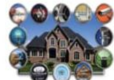
Home Automation System