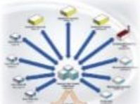
WAN (Wide Area Network)