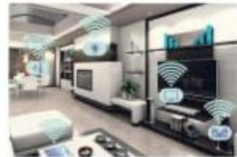
Home Automation Systems