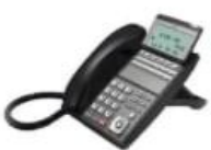
Digital Key Phone