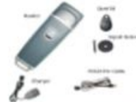
RFID Security Guard