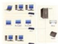
LAN (Local Area Network)