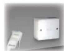
I/O Box Connection