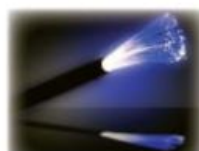
Optical Fibre Cabling